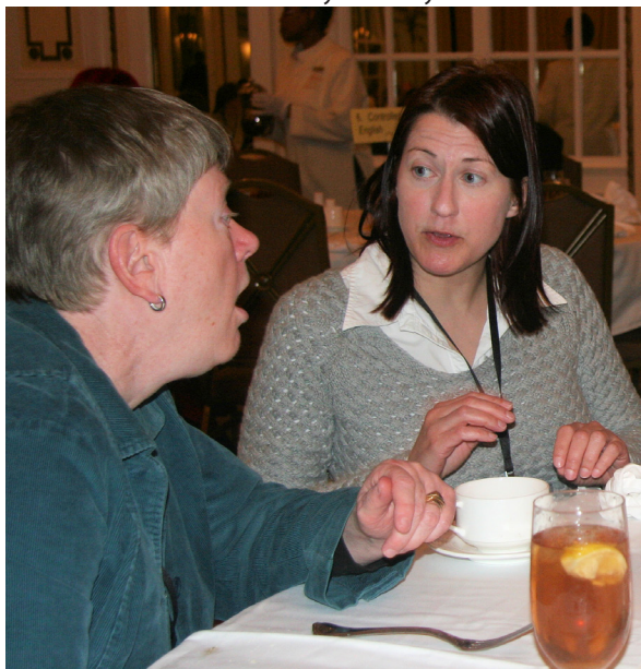
Chatting over lunch.

The conference staff would like to thank all those who attended and contributed. See you next year!