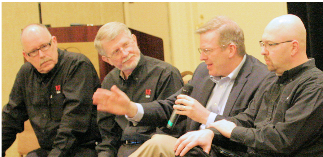
Several members of the user assistance trends panel at Adobe's Sunday morning session.

Dave's session was, as usual, filled with lots of code.