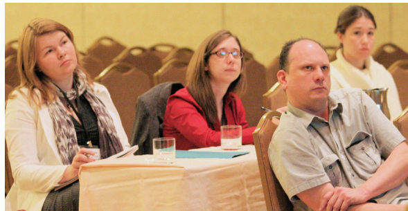
At the User Assistance 101 opening session on Sunday.