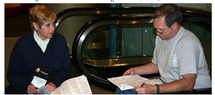
A couple of attendees plan for the three days ahead.