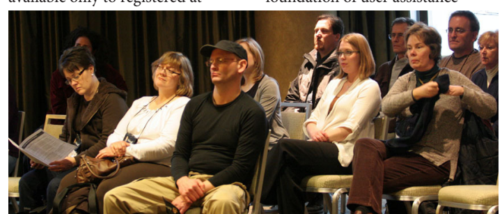
At the Sunday evening orientation session.

Despite the increasingly interactive nature of the conference, it's still important for speakers to present without interruption. Please turn off or otherwise silence your cell phone during conference sessions.