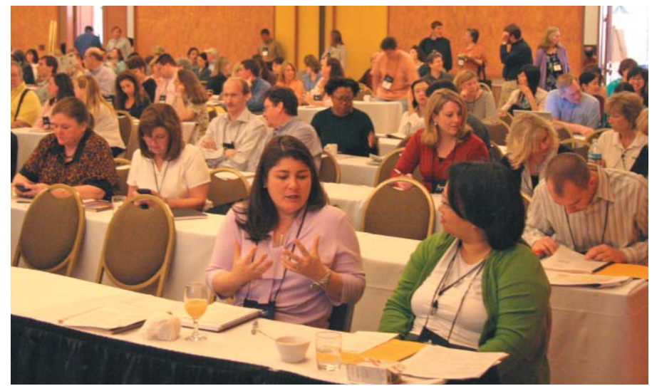
Getting ready for the first Monday session.